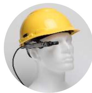
Safety Helmet Clips